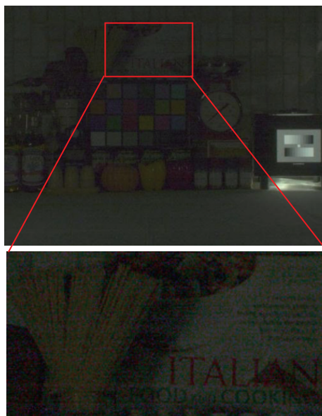
A/D conversion 14 bit mode