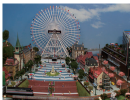
5M 4:3 recommended recording 2592H × 1944V