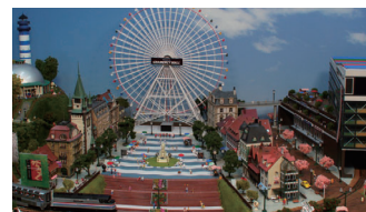
5M 16:9 recommended recording 3072H × 1728V