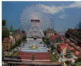
5M 5:4 recommended recording 2560H × 2048V