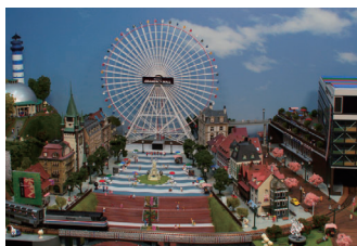
All-pixel scan recommended recording 3072H × 2048V

Number of recommended recording pixels: All-pixel scan approx. 6.29M pixels (3:2), approx. 5.04M pixels (4:3), approx. 5.24M pixels (5:4), and approx. 5.31M pixels (16:9).