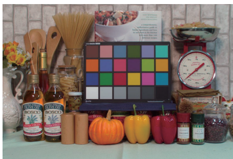
1000 lx HLP mode internal gain 12 dB, F5.6

(recommended recording approx. 5.04M pixels, 4:3, ADC 12 bit mode, 59.94 frame/s)