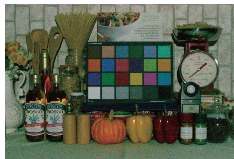
1 lx LLP mode internal gain 51 dB, F1.4